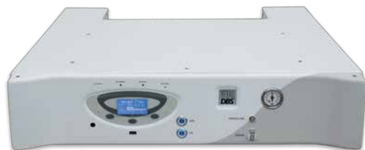
FID Flat Version for placement under GC