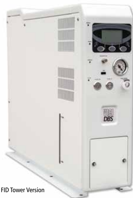
FID Tower Version